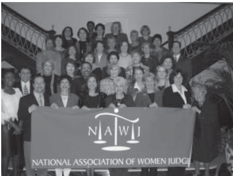
NAWJ Mid-Year Meeting Attendees