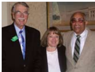
IDGC Olympia launch event held in Oct.