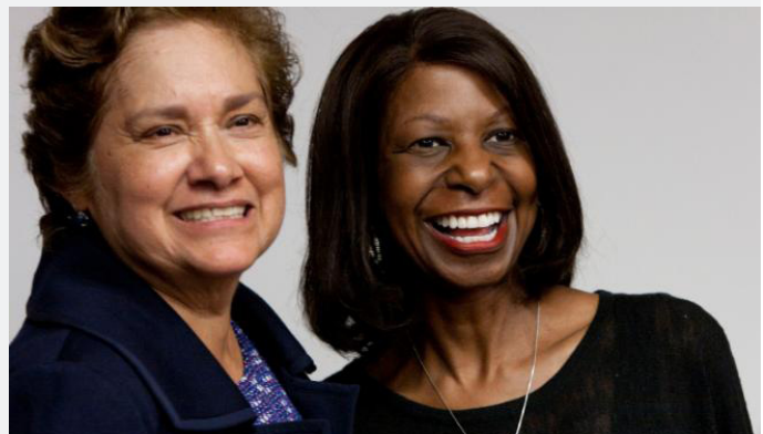
Color of Justice Program at St. Mary's School of Law, San Antonio