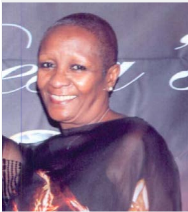
Hon. Cheryl J. Gonzales

CONGRATULATIONS, Judge Gonzales on your new appointment as Supervising Judge and NAWJ DISTRICT 2 DIRECTOR (NY, VT, CT).