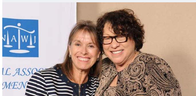
Judge Orlinda Naranjo with Justice Sonia Sotomayor at the NAWJ 2014 Annual Conference in San Diego.

Former District Director Judge Orlinda Naranjo of the 419th District Court and U.S. Supreme Court Justice Sonia Sotomayor