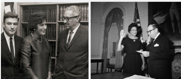
PHOTO LEFT. One of former U.S. Supreme Court Justice Thurgood Marshall's NAACP legal teams included Jack Greenberg (left) and Judge Constance Baker Motley. PHOTO RIGHT. In 1966, Judge Motley being sworn in as District Judge for the U.S. District Court, Southern District of New York.

On Monday, September 15, 2014, the New York Chapter, District Two, NAWJ's Fairness and Access Committee and the NAACP Legal Defense Fund (LDF) held a screening of the outstanding documentary film Justice is a Black Woman: The Life and Work of Constance Baker Motley . The Chief Judge of